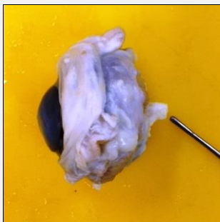
Figure 1. External view of bullock’s eye. The probe points to the optic nerve at the back of the eye. At the front of the eye note the sharp curve of the sclera coating the cornea.

Figure 1 shows the eyeball and optic nerve.